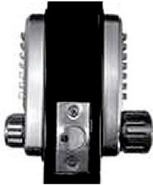
Door Edge View