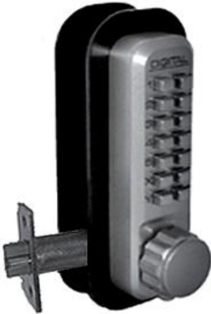
Inside & Outside same